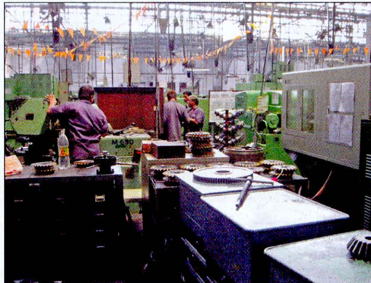
Crown wheels being assembled and inspected at Eicher Engineering's Thane facility

a turnover of around Rs 140 crore last year, is hoping to cross Rs 250 crore in turnover next year and is