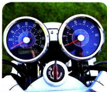
• Twin-pod analogue instruments are easily legible even on the fly.