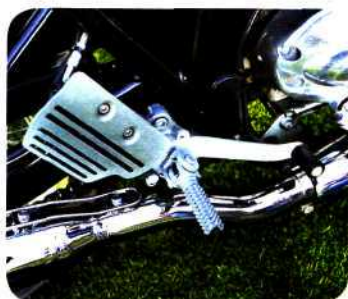
● The footpeg setup gives a sporty stance, with decent touring comfort.