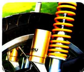
● Adjustable gas-charged rear suspension is by Paioli on the GT.