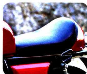
● The slim, sporty single saddle shows off neat body colour stitching.