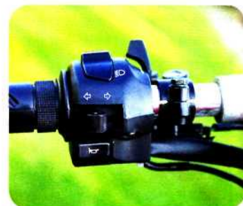
• Clip-on bars accommodate typical Royal Enfield switchgear.