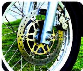
• 300mm Brembo disc, with steel braided hose works perfectly.