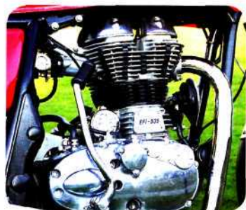
● 535cc powerplant feels just about adequate for this sporty classic.