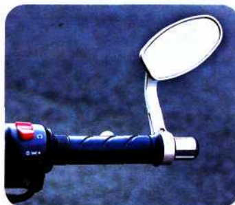
• RE crafted mirrors give good visibility despite being small.